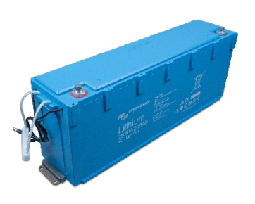
Secured with mounting brackets